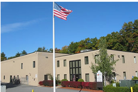
Headquarters Expands Again to Salem, NH (2001)