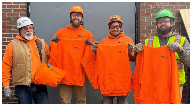
Leading with Safety Program Recipients

Methuen Construction's safety commitment is led by its VP of Safety, Risk & Controls, Assistant Corporate Safety Director and several dedicated Site Safety & Health Officers. This commitment to safety helps us maintain an EMR well below the industry standard of 1.0.