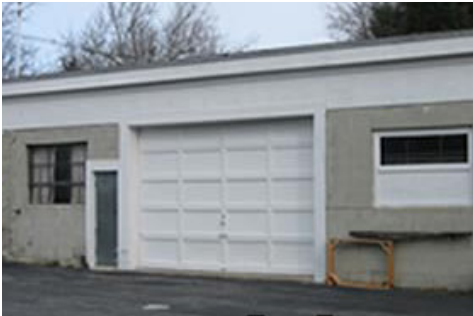
Original Headquarters (1960)