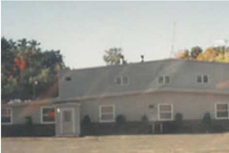
Headquarters Expands to Methuen, MA (1972)