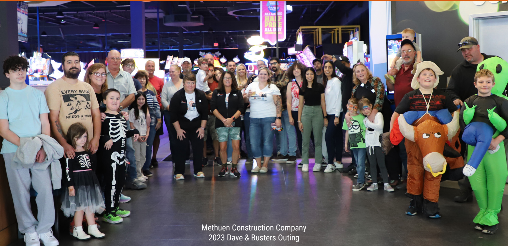
Methuen Construction Company 2023 Dave & Busters Outing

The Methuen Way identifies the five core, ethical values that represent who we are as an organization. At Methuen Construction, it is important that our individual decisions incorporate the following core values: